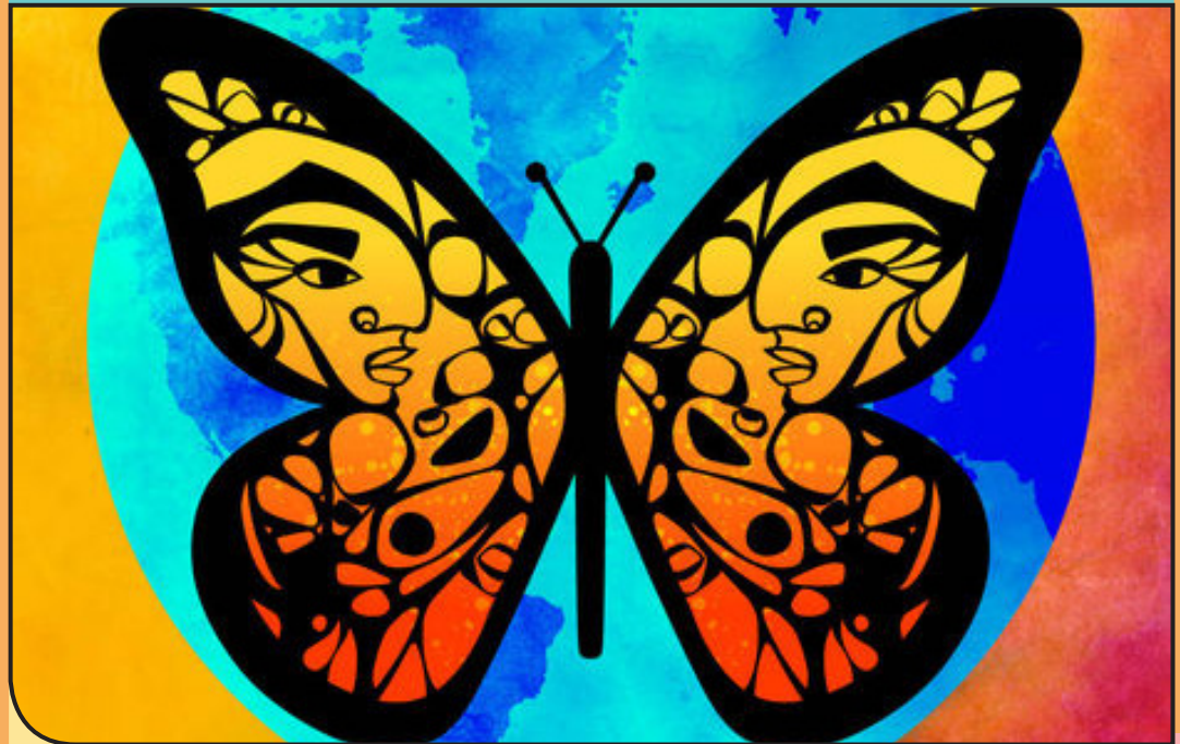
MIGRATION BUTTERFLY FAVIANNA RODRIGUEZ